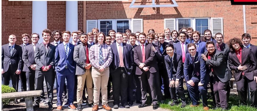
University of Cincinnati Triangle Actives at the Chapter House, April 2022