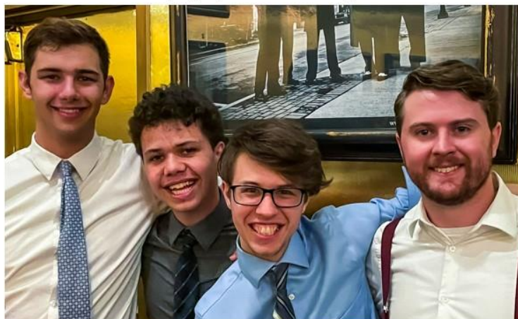
Triangle Spring Formal

Last year, we hosted many philanthropy events, such as our classic "Delta T Mac 'n' Cheese" and our Charity Smash Tournament, which both yielded great results. However, these successes were eclipsed by the results generated from our participation in the "Flying Pig Marathon" event. Nine of our Brothers pulled an all-nighter on Halloween to help set up for the event. It was a fun event, with some Brothers saying it was the best philanthropy event of the year. For our help, we received $800 to donate to our philanthropy, FIRST Robotics.