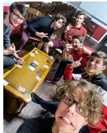
Board Game Night

So far this year, we have sponsored one philanthropic event and are planning additional events. In March, we were finally able to resume our volunteer work that had been curtailed because of to Covid restrictions. I have increased our social media presence via weekly Instagram posts.