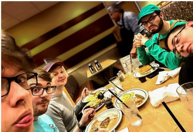
Flying Pig Marathon All-Nighter

As the semester started, my first step was to reformat key documents such as new-member education materials and required IFC forms and enter them on the Chapter Google Drive for easy future access. I conducted a search and selected a wonderful location for our pledge retreat. Our pledges and I will be traveling to the Louisville Chapter of Triangle, which will form some great memories and relationships among the pledges of both Chapters. This year has moved very quickly, and I am grateful to be an E-Board member. The memories and experiences that I've gained will last a lifetime. I cannot wait to experience the exciting opportunities that await our chapter next year!