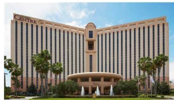
Rosen Plaza Hotel & Convention Center