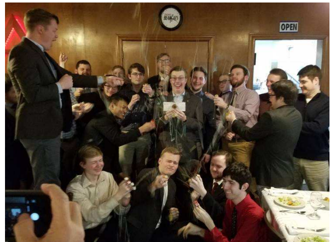
Celebrating a 4.0 at the Beef and Beans banquet

The Park W. Gast Educational Foundation held the Spring, 2018 Beef and Beans Challenge banquet on March 3 rd . The Actives had a higher Fall GPA than the pledges, earning them an elegant steak dinner, while the pledges feasted on beans and weenies with a side of soda crackers. The highlight of the event was the awarding of $7,525 in scholarships based on the number of A's on each person's Fall report card. In addition, PWG recognized three top achievers who earned a perfect 4.0 with gold challenge coins. This friendly (and lucrative) event was enjoyed by all!