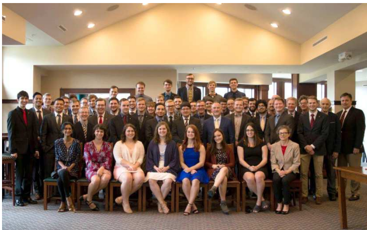
Participants in the 2018 Founder's Day banquet