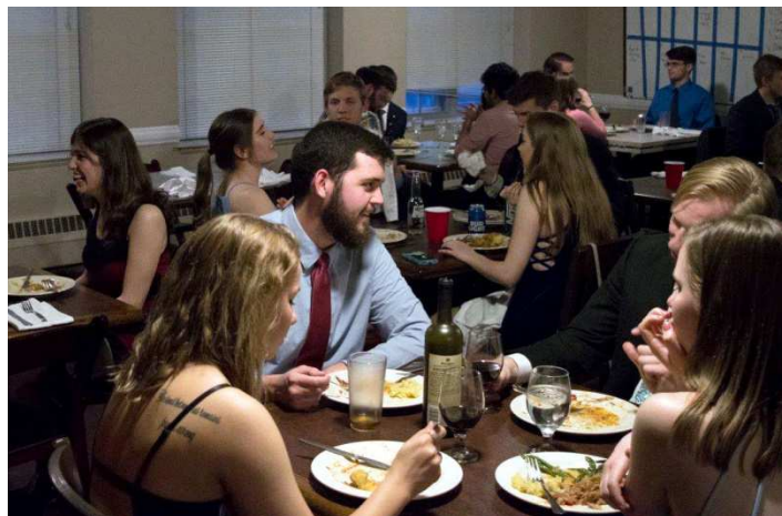
Actives and their guests at the Spring Formal