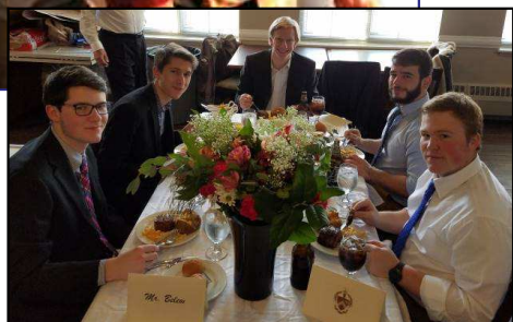
Previous work session and Beef & Beans