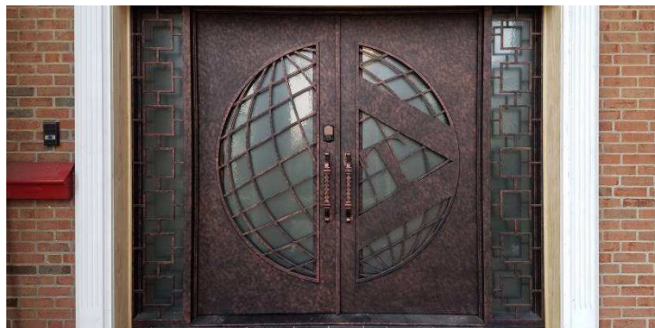
A new front door was the biggest project of the year

It was a great year for the chapter house at the University of Cincinnati.