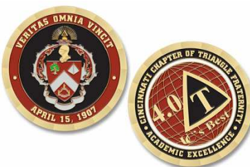
Coveted 4.0 gold medallion