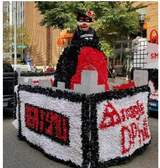
The Delta Phi Lambda/Triangle float with Queen Bearcat

This past fall, the Cincinnati Chapter of Triangle once again participated in UC's Homecoming celebration. We partnered with the women of Delta Phi Lambda for a week full of socialization and float building. This theme for this year's Homecoming was "The Queen City," in honor of the beautiful city that we call home. Our float, which is pictured above, included a city skyline, the names of both organizations, the theme, and "Beat SMU," who were the Bearcats' opponent for the game. We also had one of our members dress up as the 'Queen' Bearcat using a homemade Bearcat head, a crown, and a pomped dress of sorts. We had a lot of fun and are looking forward to next year's Homecoming, where we will be partnering with the women of Phi Sigma Rho and the men of Phi Delta Theta.