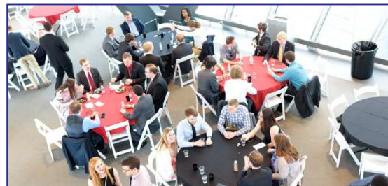
Founder's Day brunch 2017

We will be holding our annual Founder's Day celebration on April 15th. We will start with a reception at the house, invite those interested to join us for a guided tour of campus highlighting recent changes and improvements, then gather for brunch, presentations and awards in the newly remodeled Nippert Stadium Press Lounge. We will begin in the late morning and conclude early in the afternoon. Please mark your calendar and plan to celebrate 111th anniversary of Triangle's founding with us.