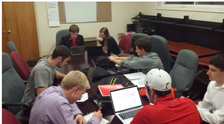
New members and brothers participating studying collaboratively during a study tables session