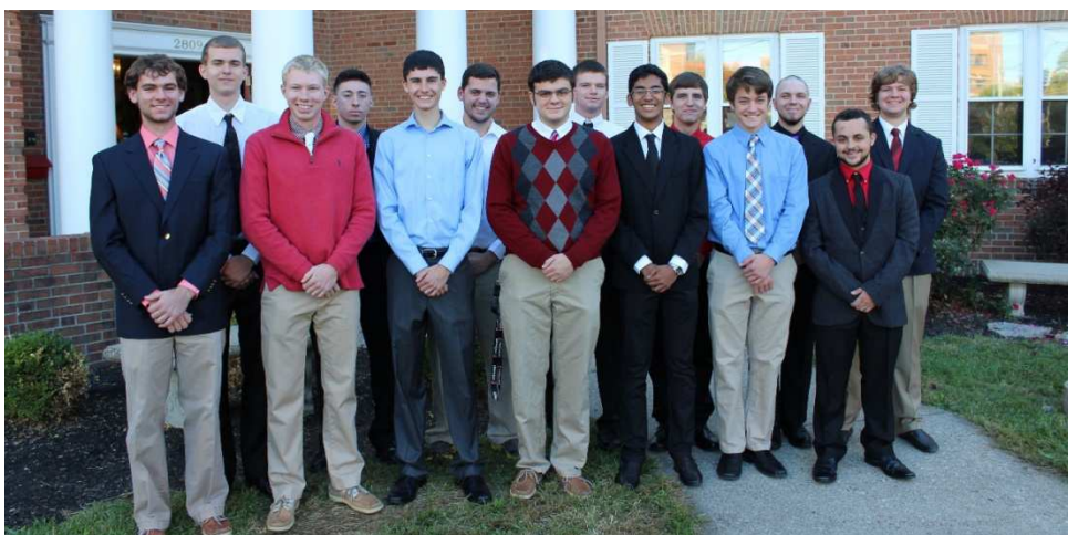
Fourteen of the eighteen new members of the 2014 Fall Iota class.