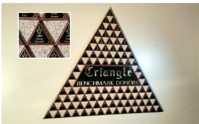
New plaque on the living room wall honors Benchmark donors

A new plaque has been installed in the living room of the chapter house to permanently recognize those who have made donations to the 5in5 campaign at the Benchmark level ($1000 and up). The new plaque is a granite triangle with 96 individual engraved walnut plaques that contain donor's names and initiation years. The chapter is honored to have names on 19 of the plaques already. Thanks to everyone who has participated. Make it a point to stop by the house soon to see this magnificent display.