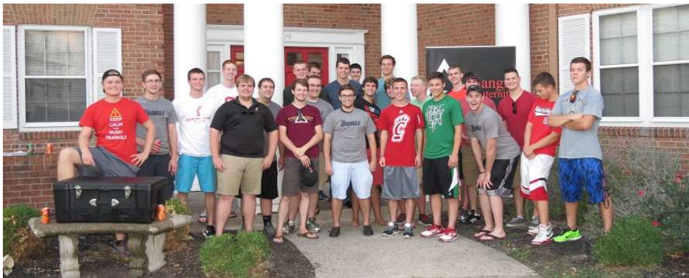
Potential new members and actives after the rush week corn hole tournament